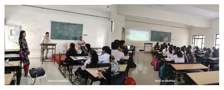
UI UX design